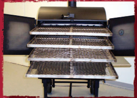
Smoke box houses (4) easy slide out Stainless steel grates